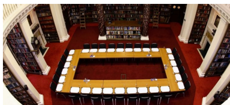
Conference venue, SixtyOne Whitehall