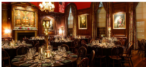
Dinner at Armoury House, City of London